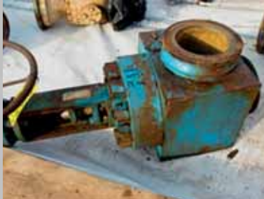
Onsite or offshore Valve with Destec Hub ends ready for machining

Other factors to highlight include. The importance of appropriately trained and skilled technicians. The use of appropriate tools and equipment. Detailed procedures to work to, with effective supervision and inspection. The importance of keeping effective records of work undertaken.