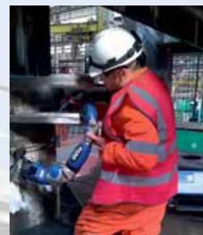
Faro arm dimensional inspection