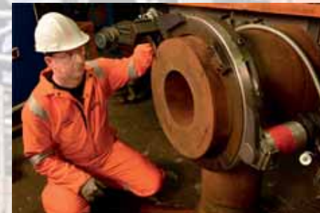
Pre weld preparation and pipe cutting