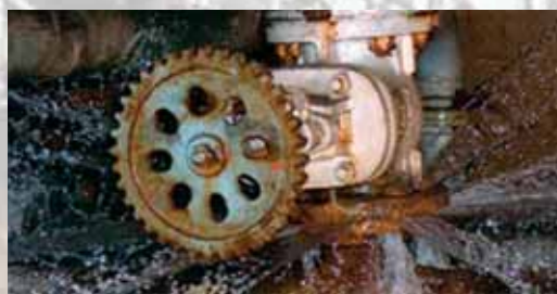
DESTEC ON-SITE SERVICES 5