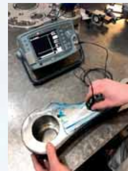
Ultra sonic testing

Destec have four types of Non-Destructive, Liquid Penetrant, Magnetic Partial, Ferrite and Ultra Sonic Testing, as well as our in-house dedicated NDT area, Our service engineers can operate with portable NDT and inspection equipment for your site needs. Destec can give full inspection report of all critical joints, which enables the site to know of any potential leaking joints that would require maintenance. This is part of the Destec service which achieves a 'Leak-free startup'. Destec can address the issues associated with joint & sealing.