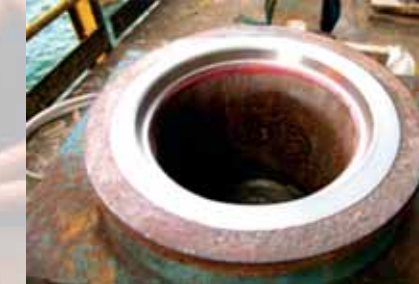
Valve finished machined & NDT tested