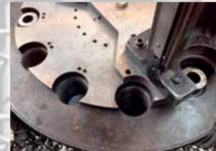
Nimonicon stud removal in Power industry.