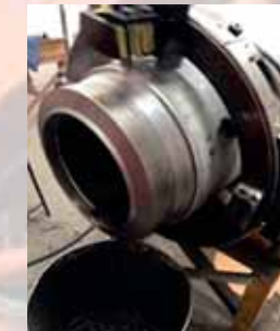
Finished weld prep with ID & OD matched machined